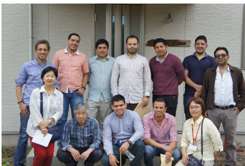
Observation of wooden model house