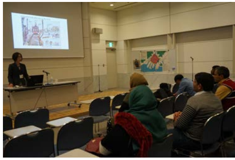
Lecture by Atomic Bomb Survivor