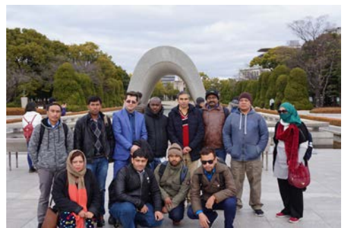
Peace Memorial park in Hiroshima