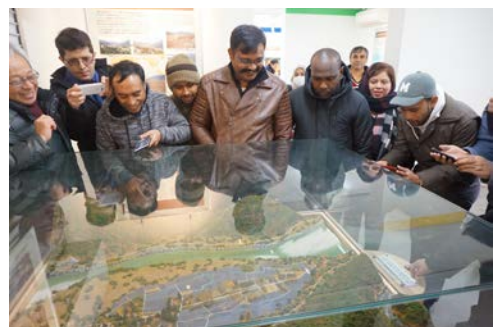
Nojima Fault Preservation Museum