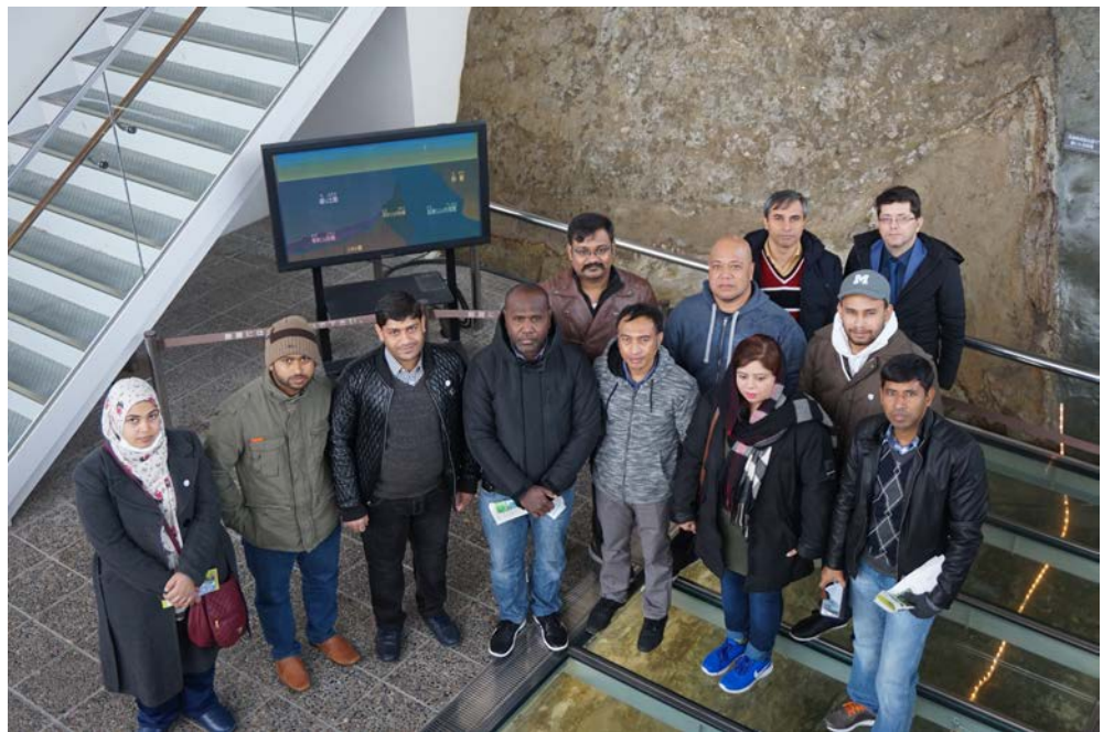
Nojima Fault Preservation Museum