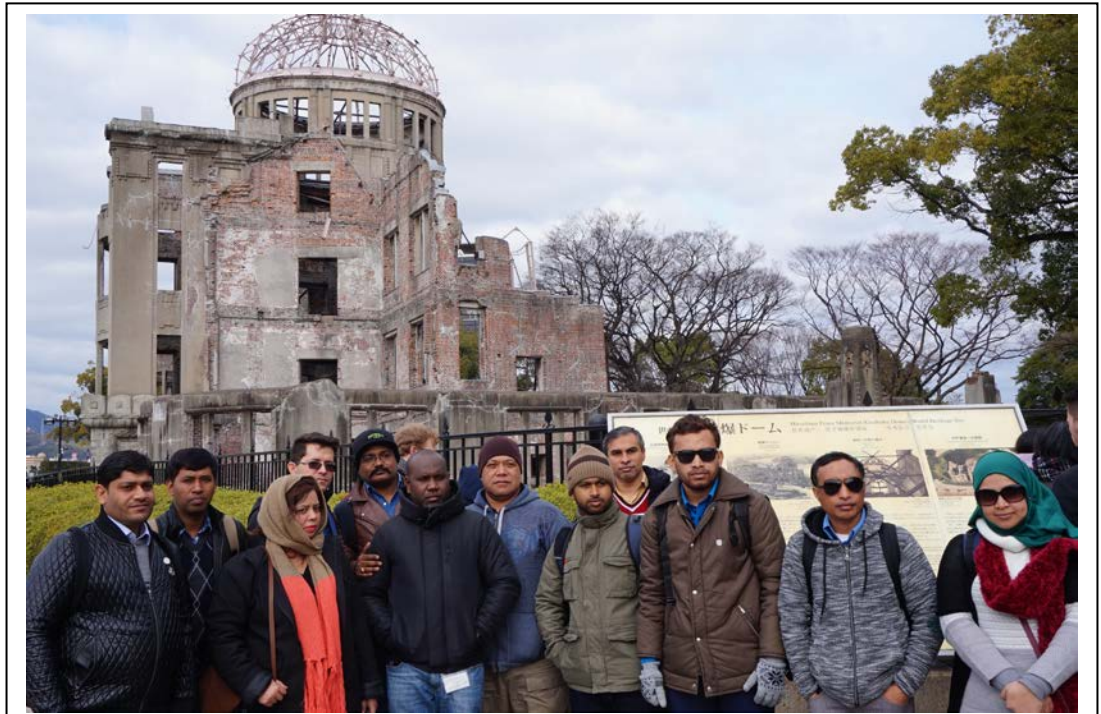
In front of Atomic bomb dome in Hiroshima