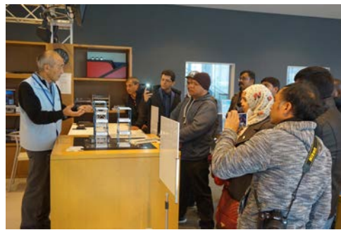
Disaster Prevention and Human Renovation Institution