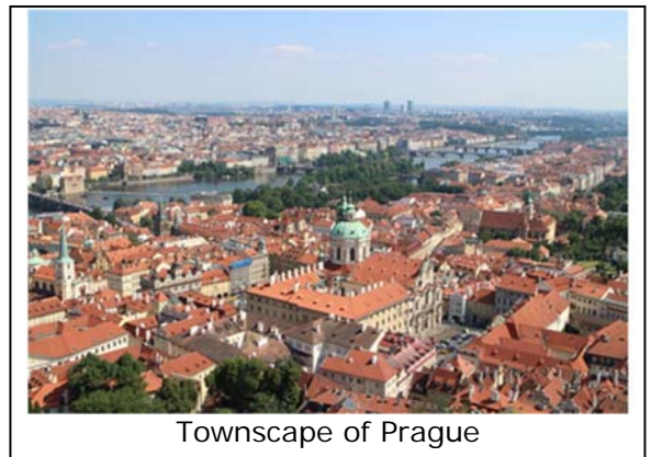
Townscape of Prague

The International Union of Geodesy and Geophysics (IUGG) is the largest international academic society related to Geodesy and Geophysics that is comprised of eight associations and three committees. IUGG is positioned as one of the unions of the International Council for Science (ICSU) and holds the general assembly at four-year intervals. The general assembly of this time was held in Prague, Czech Republic from June 22 to July 2.