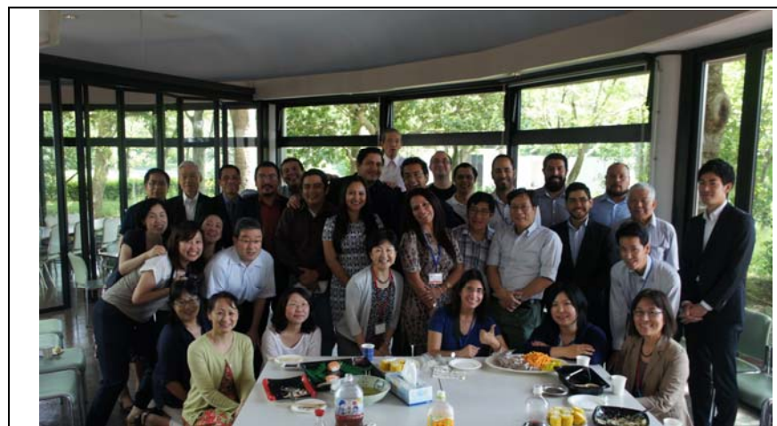
Group Photo at Lunch Party